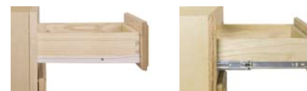
European style drawer glide.