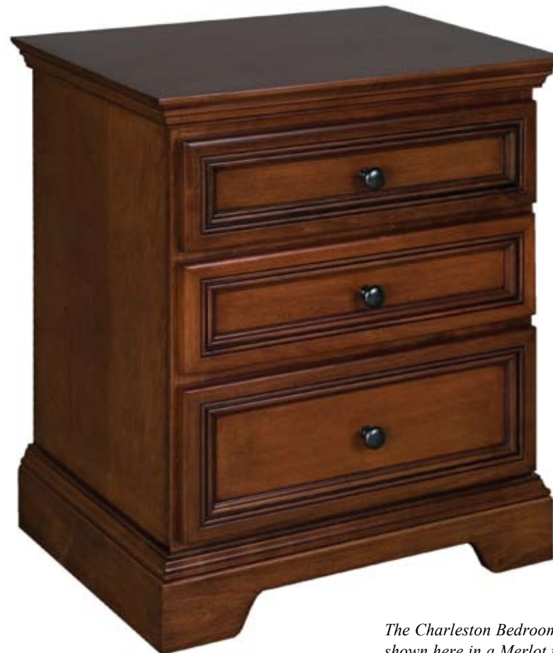
The Charleston Bedroom Includes this three drawer nightstand shown here in a Merlot finish on Maple wood.