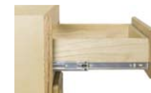
Full extension, ball-bearing, soft close drawer glide. (.SC)

SOFT CLOSE DRAWER GLIDES ADD .SC TO THE END OF THE MODEL NUMBER.