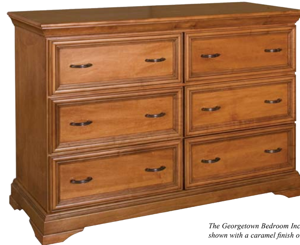
The Georgetown Bedroom Includes this six drawer dresser WC_1Y0302B shown with a caramel finish on maple wood.