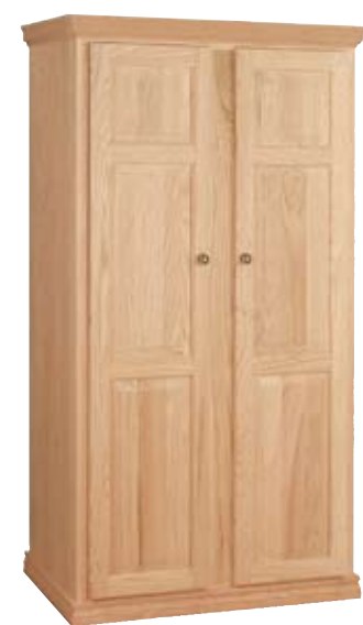
d. Wardrobe no modifications WC_1B0501 38" w x 72" h x 25" d one hanging bar flat grain wood knobs WC_1B0502 38" w x 72" h x 25" d four adjustable shelves flat grain wood knobs