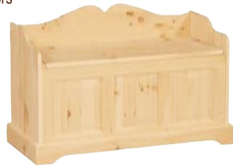
b. Blanket Chest WC_1B0202 43" w x 21" h x 19 3/4" d lid support