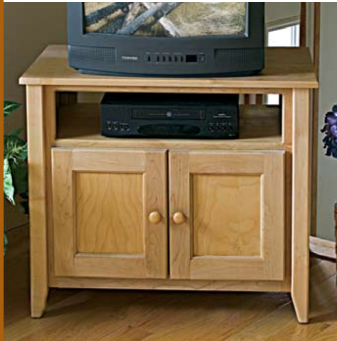
Shaker TV Cabinet WC_3D1903