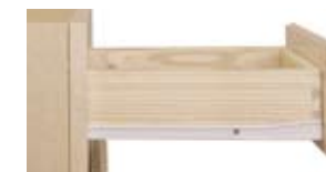
European style drawer glide.