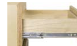
Full extension, ball-bearing drawer glide.

Full Ext. drawer glides add .FE to the end of the model number.