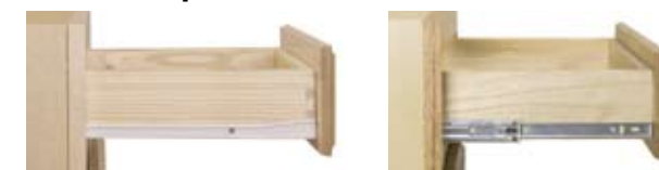
European style drawer glide. Full extension, ball-bearing drawer glide.

Full Ext. drawer glides add .FE to the end of the model number.