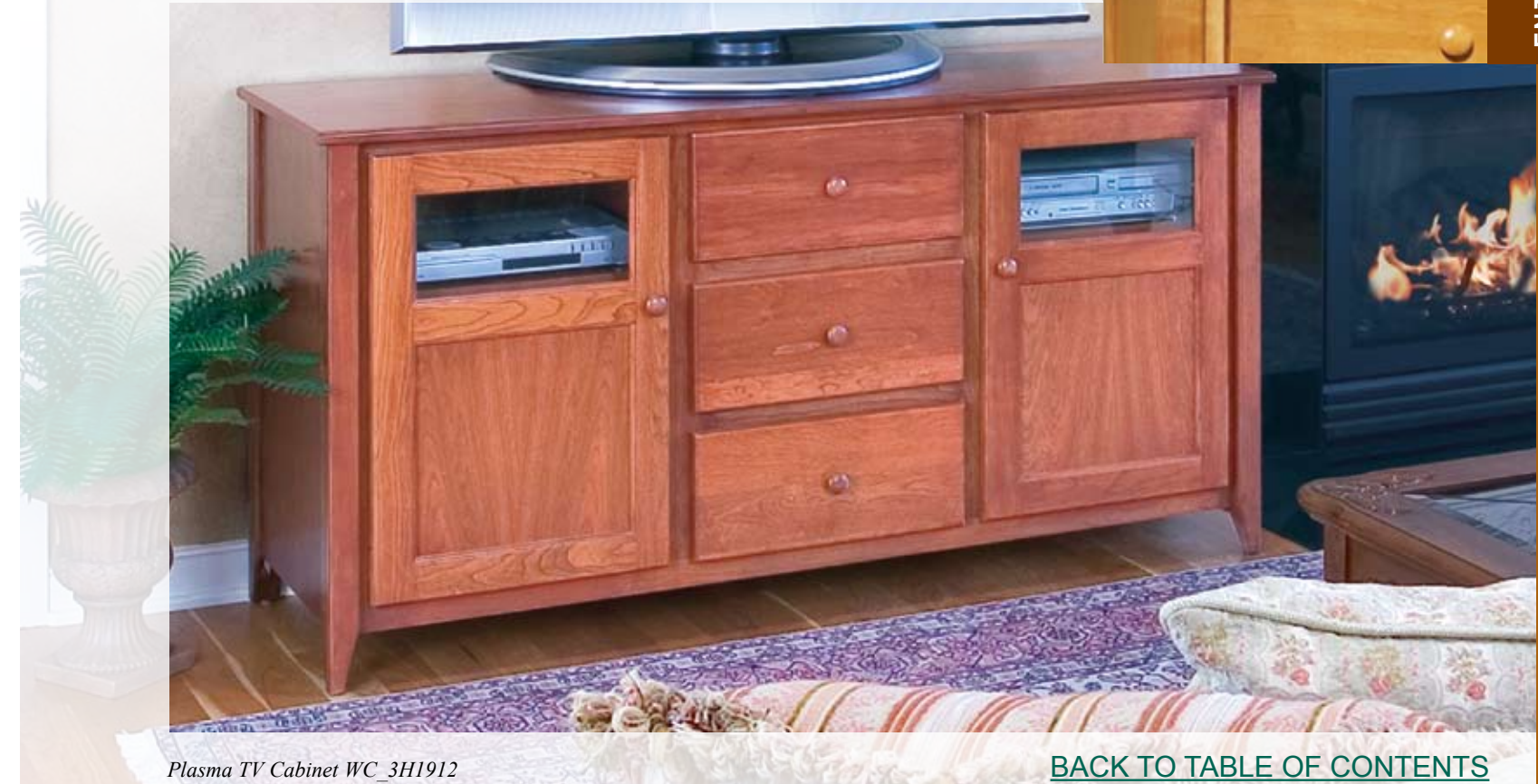
Plasma TV Cabinet WC_3H1912