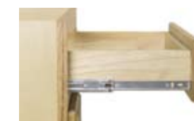
Full extension, ball-bearing drawer glide.

Full Ext. drawer glides add .FE to the end of the model number.