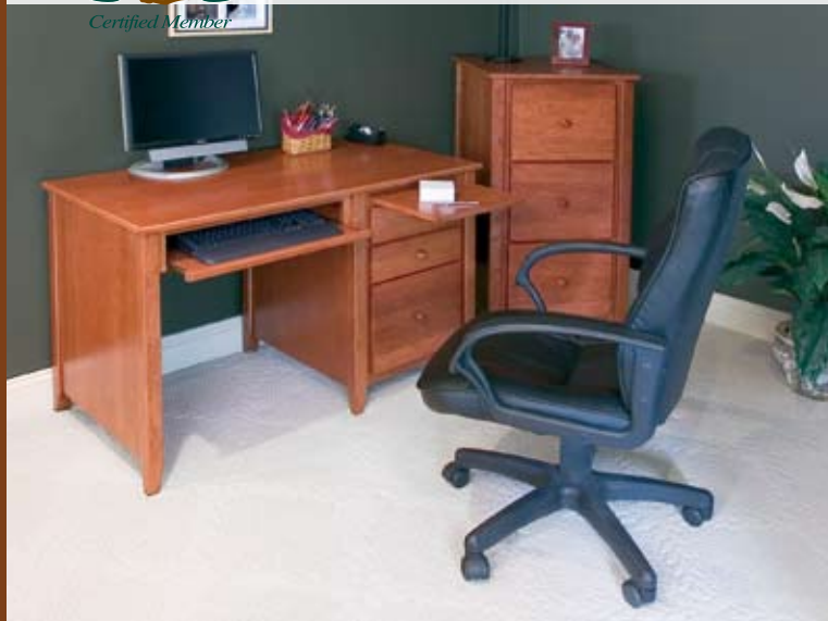
Shaker Single Pedestal Desk WC_4D0705 Three Drawer File Cabinet WC_4D1002