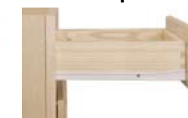
European style drawer glide.