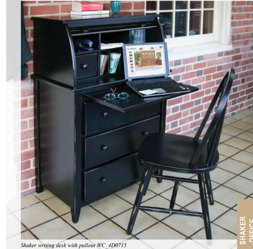
Shaker writing desk with pullout WC_4D0715