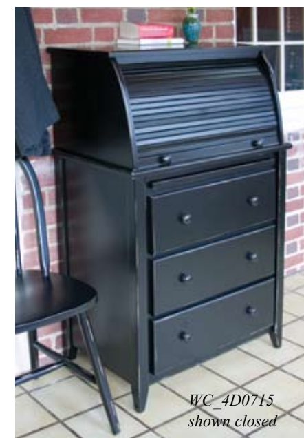
WC_4D0715 shown closed

Our beautifully crafted Shaker office creates a calm, functional atmosphere in any home or office.