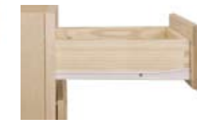
European style drawer glide.