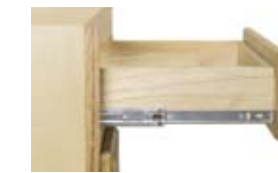
Full extension, ball-bearing drawer glide.

Full Ext. drawer glides add .FE to the end of the model number.